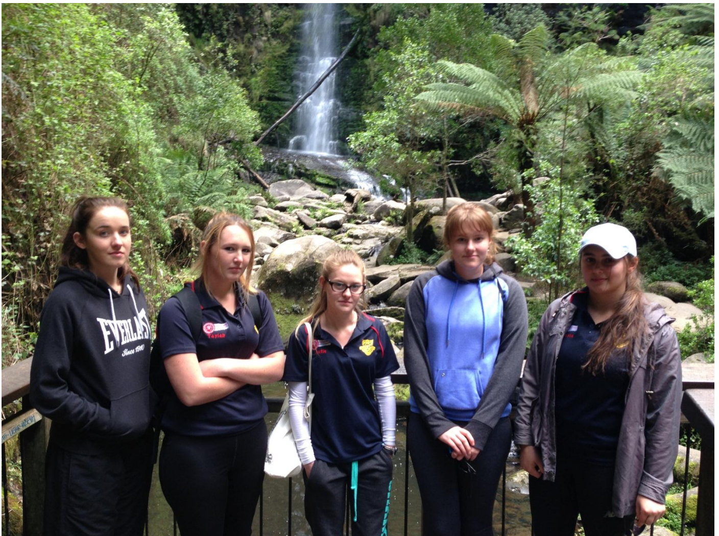
D of E Silver and Gold students at Erskine Falls