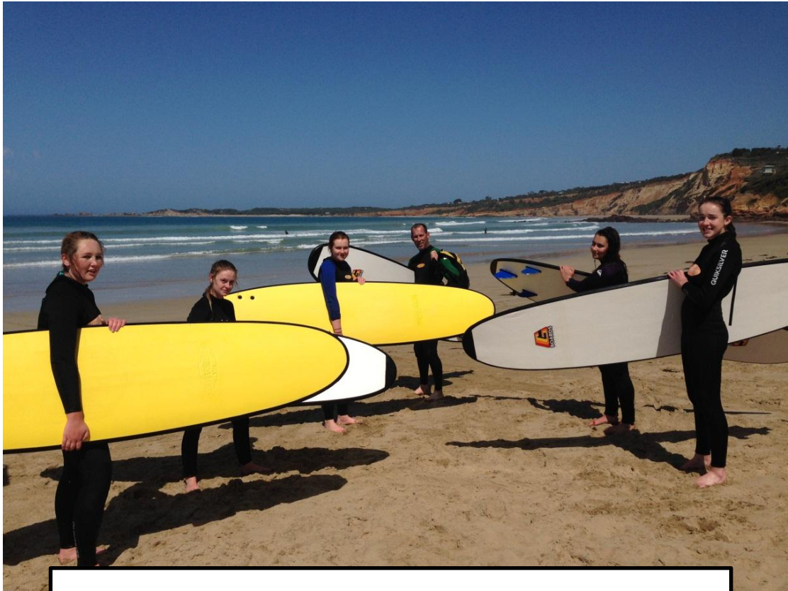
D of E students at Anglesea Beach