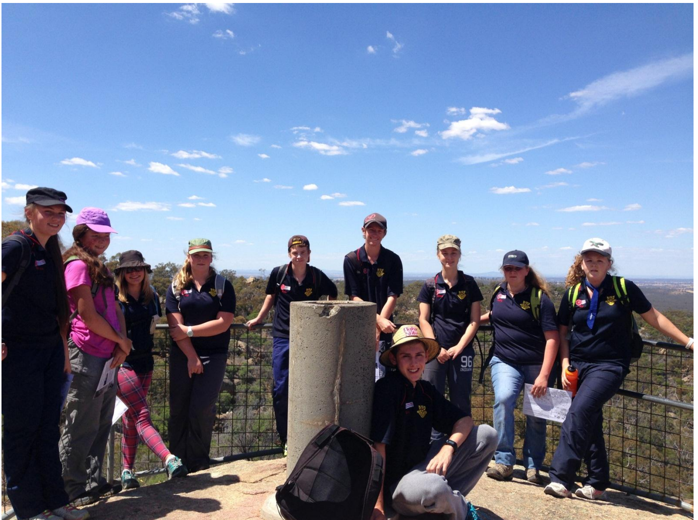
Duke of Ed qualifying camp at Melville Caves Lookout