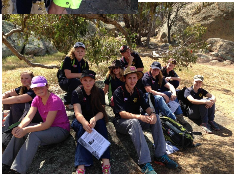
A well-deserved rest