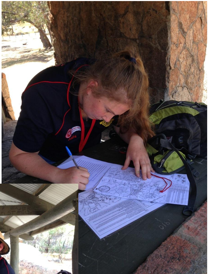
concentrating hard on a map reading activity