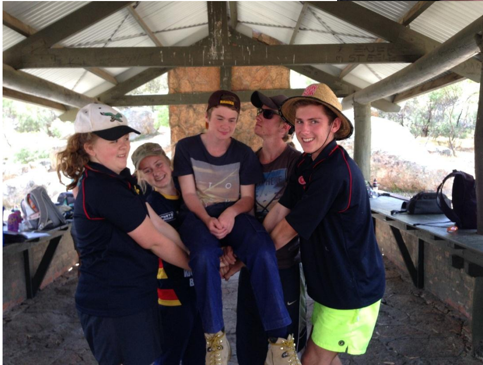
Team building exercise