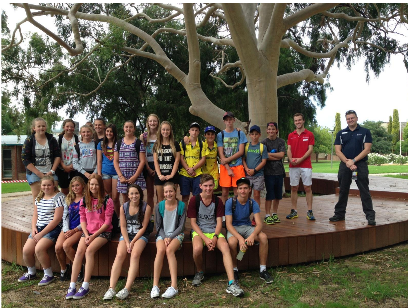
Year 9 students at CSU Wagga