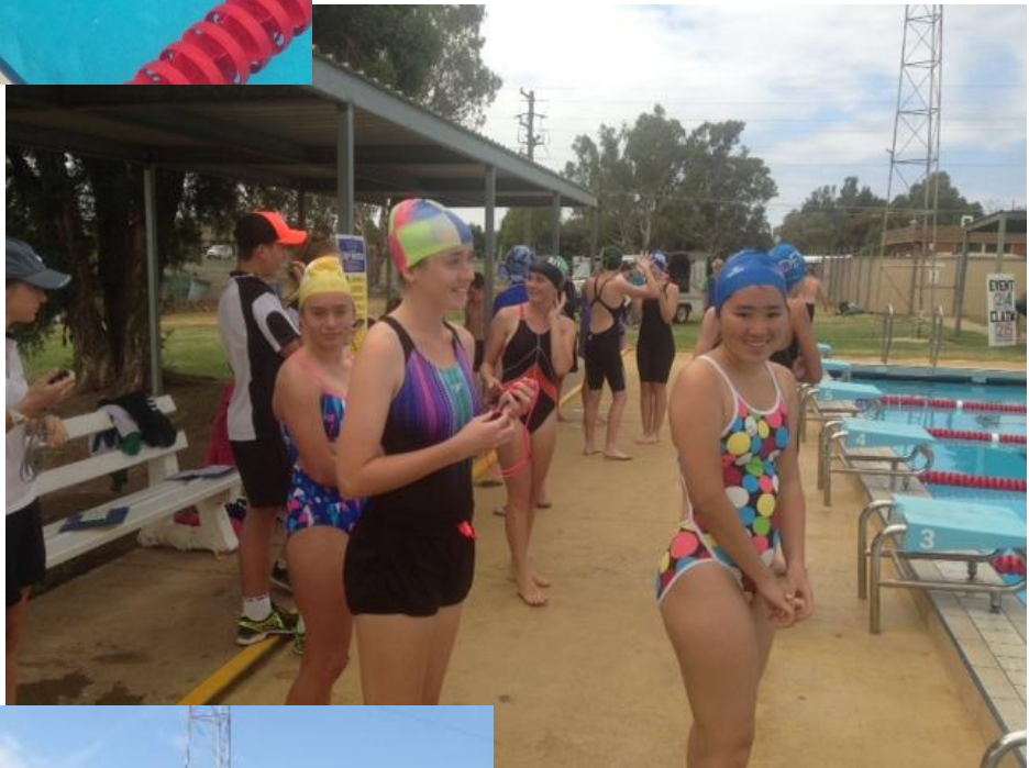
ready for the relay