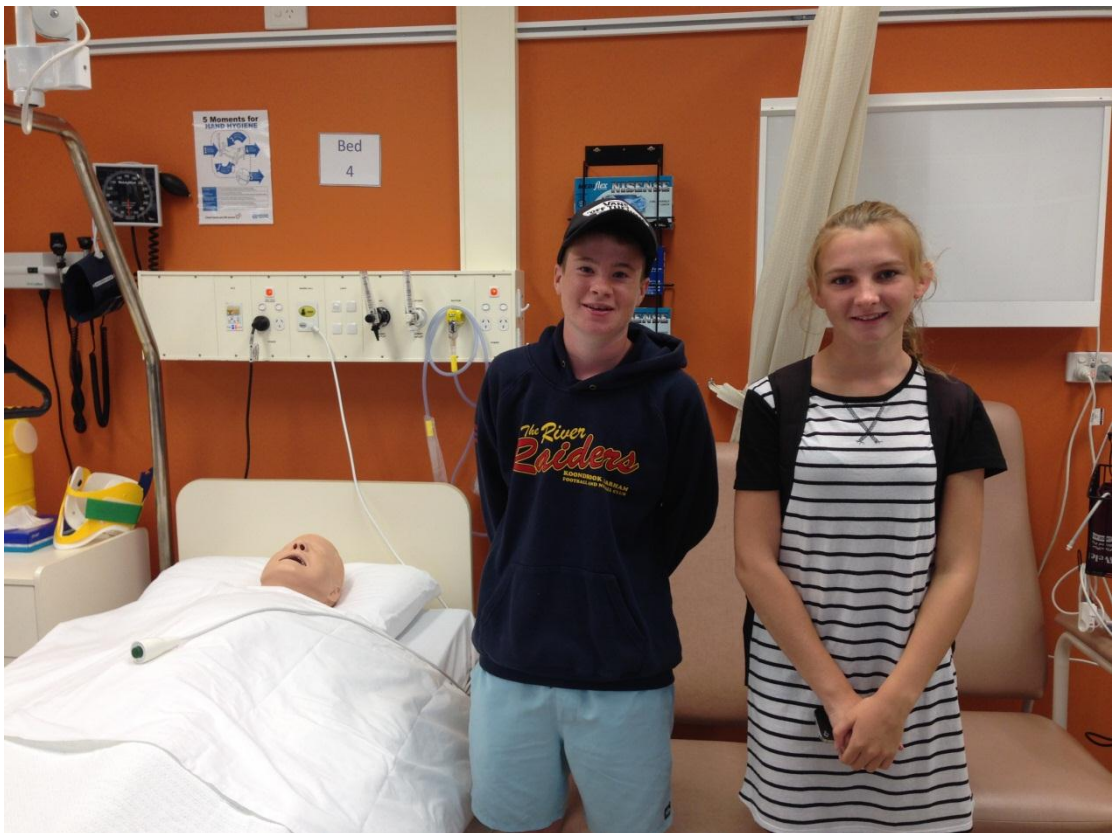
at the CSU Nursing Ward