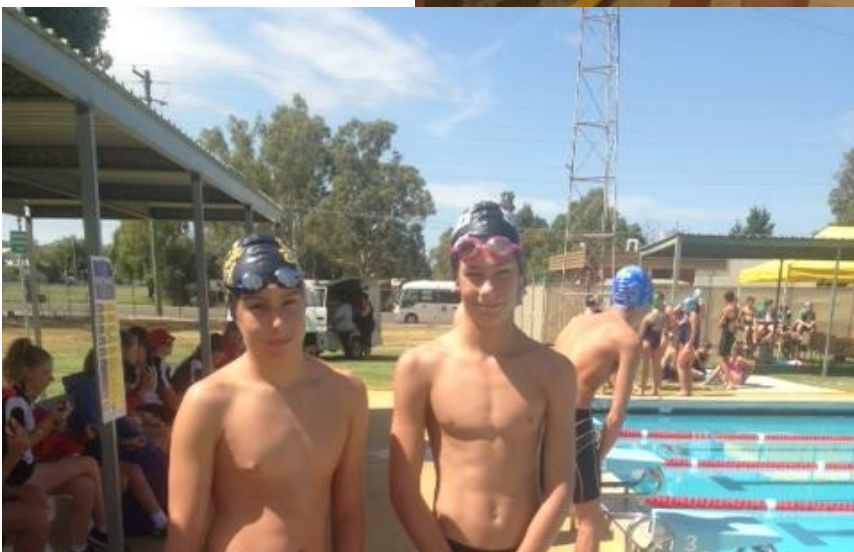
part of the successful U14 boys relay team