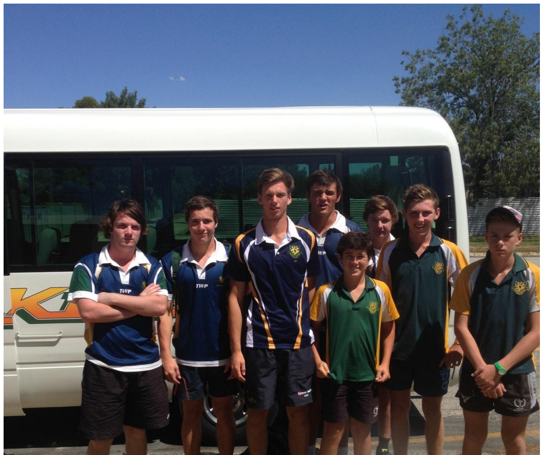
Open Boys Basketball team