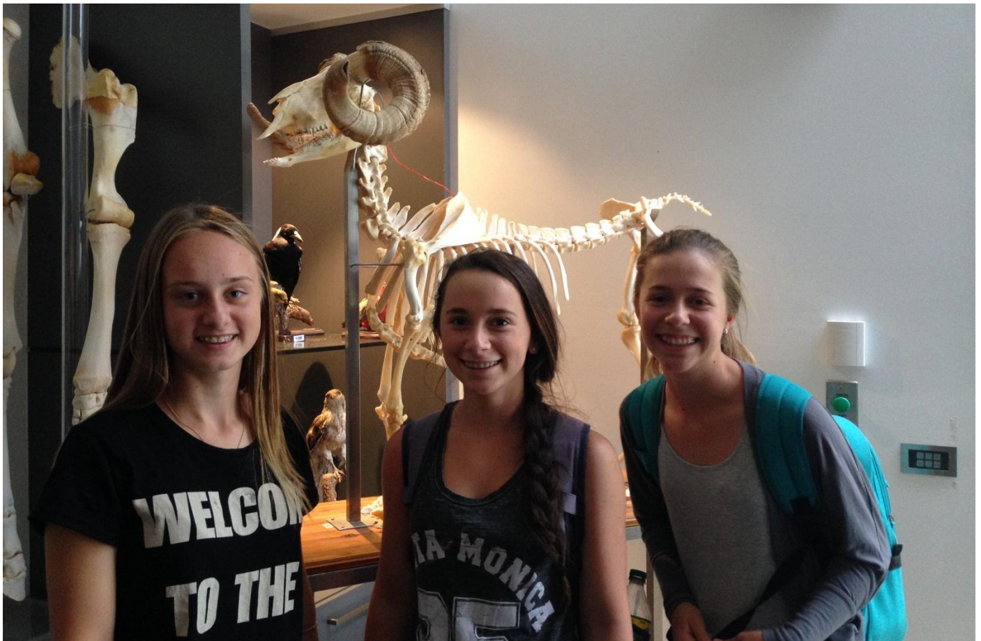
at the CSU labs

The Year 9 students who did not attend the trip will have the opportunity to participate in the MyCareerMatch online program in Careers classes this week.