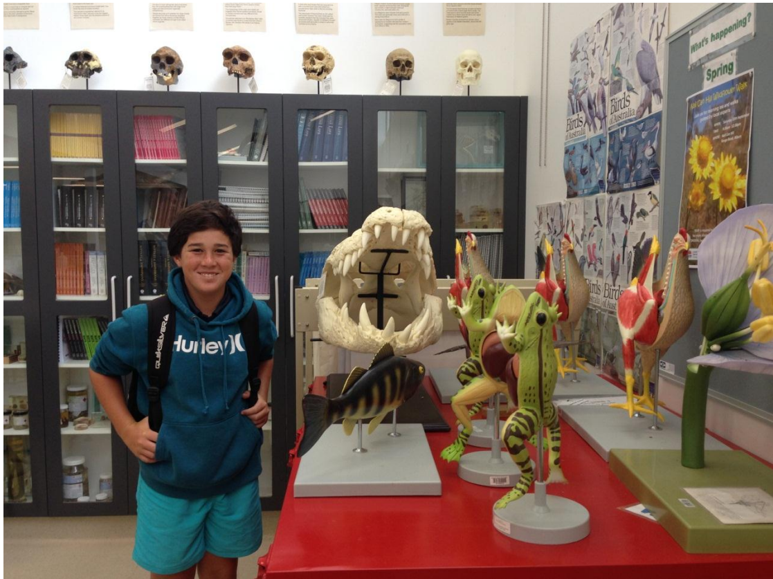
enjoying the Environmental Science lab displays