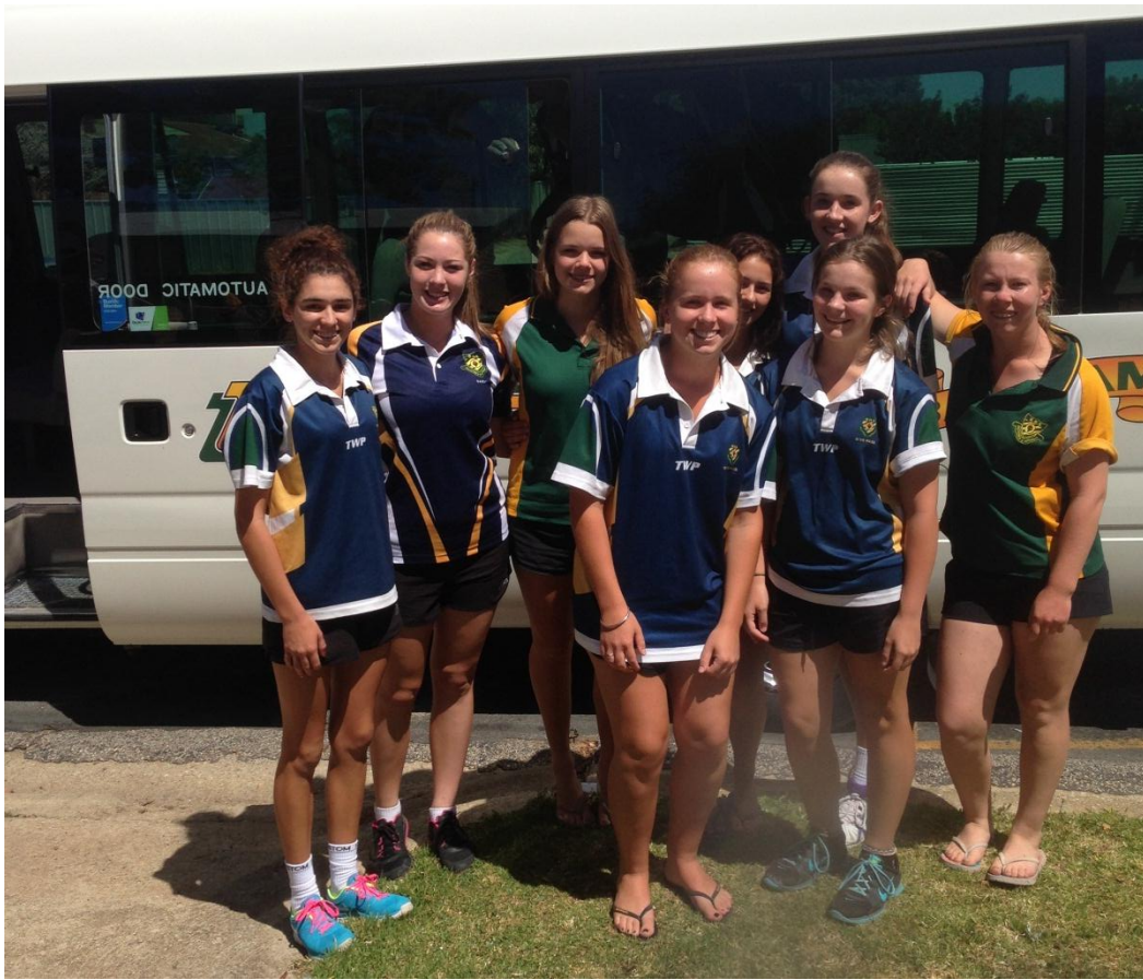
Open Girls Basketball team