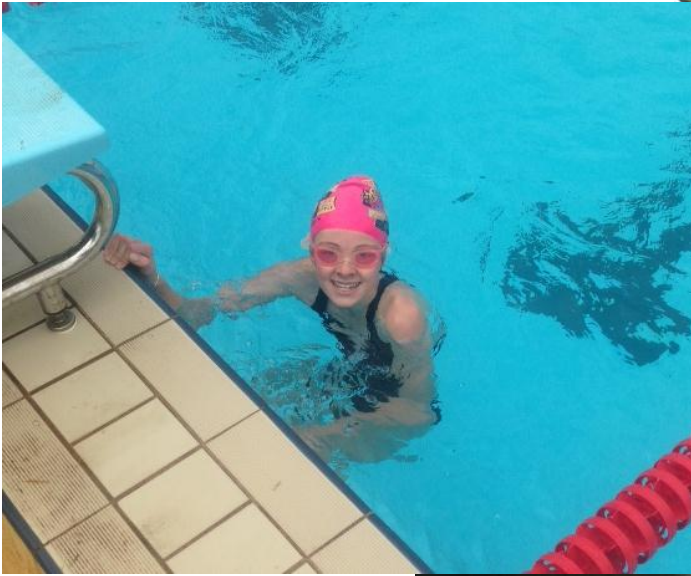
just completed a great swim