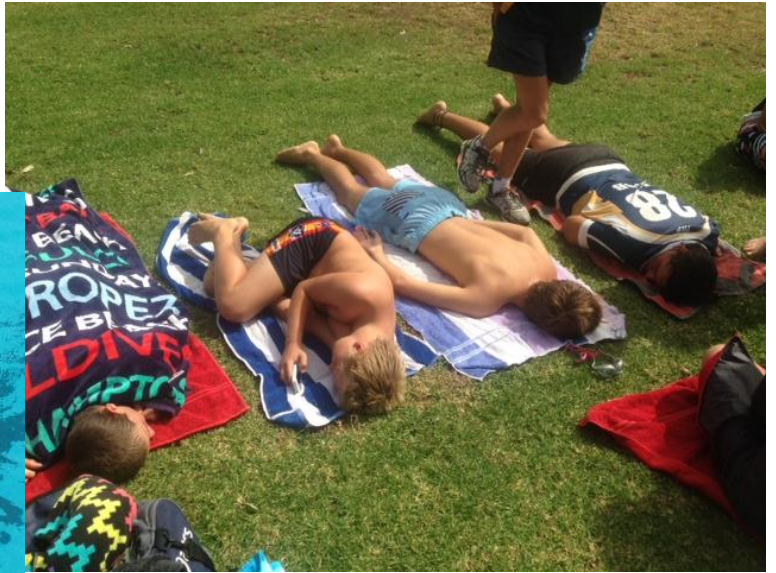
all tucked out