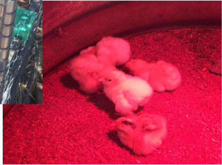
Newly Incubated Chicks