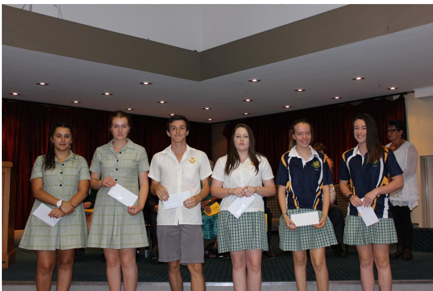
BHS Scholarship winners