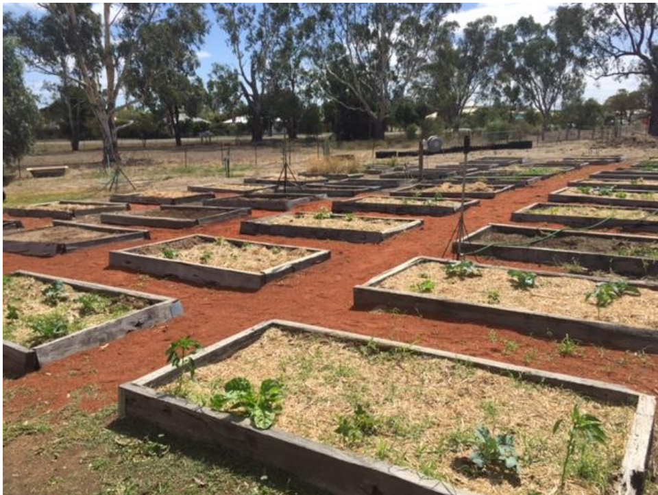
Crops look fantastic