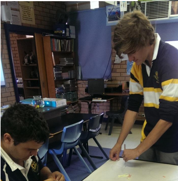
Constructing models of Meiosis in Biology