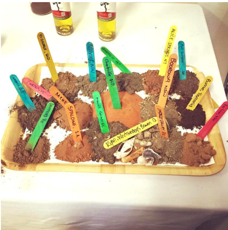
Soil Samples From Across The Country