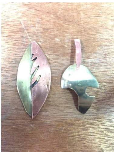
KYLE WALDEN MILLS & GARRY LOLICATO