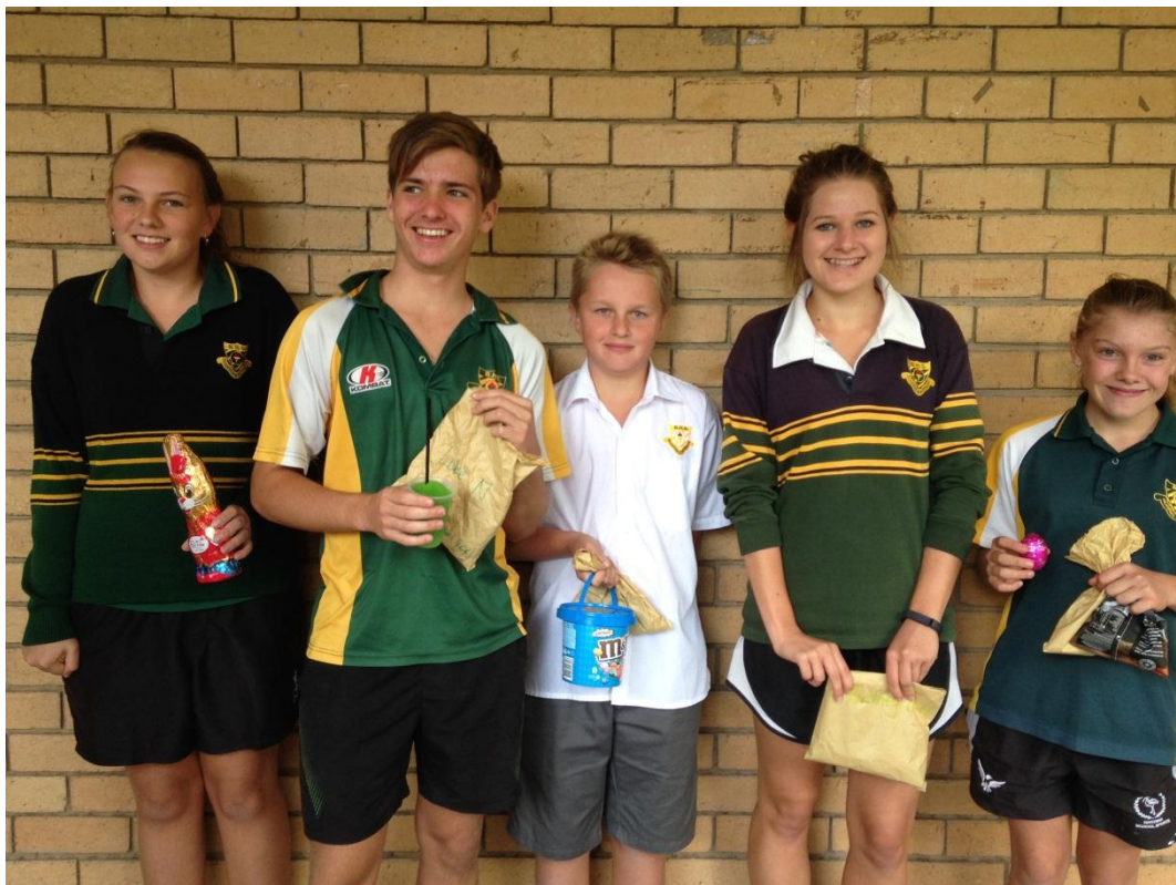
The very happy winning students