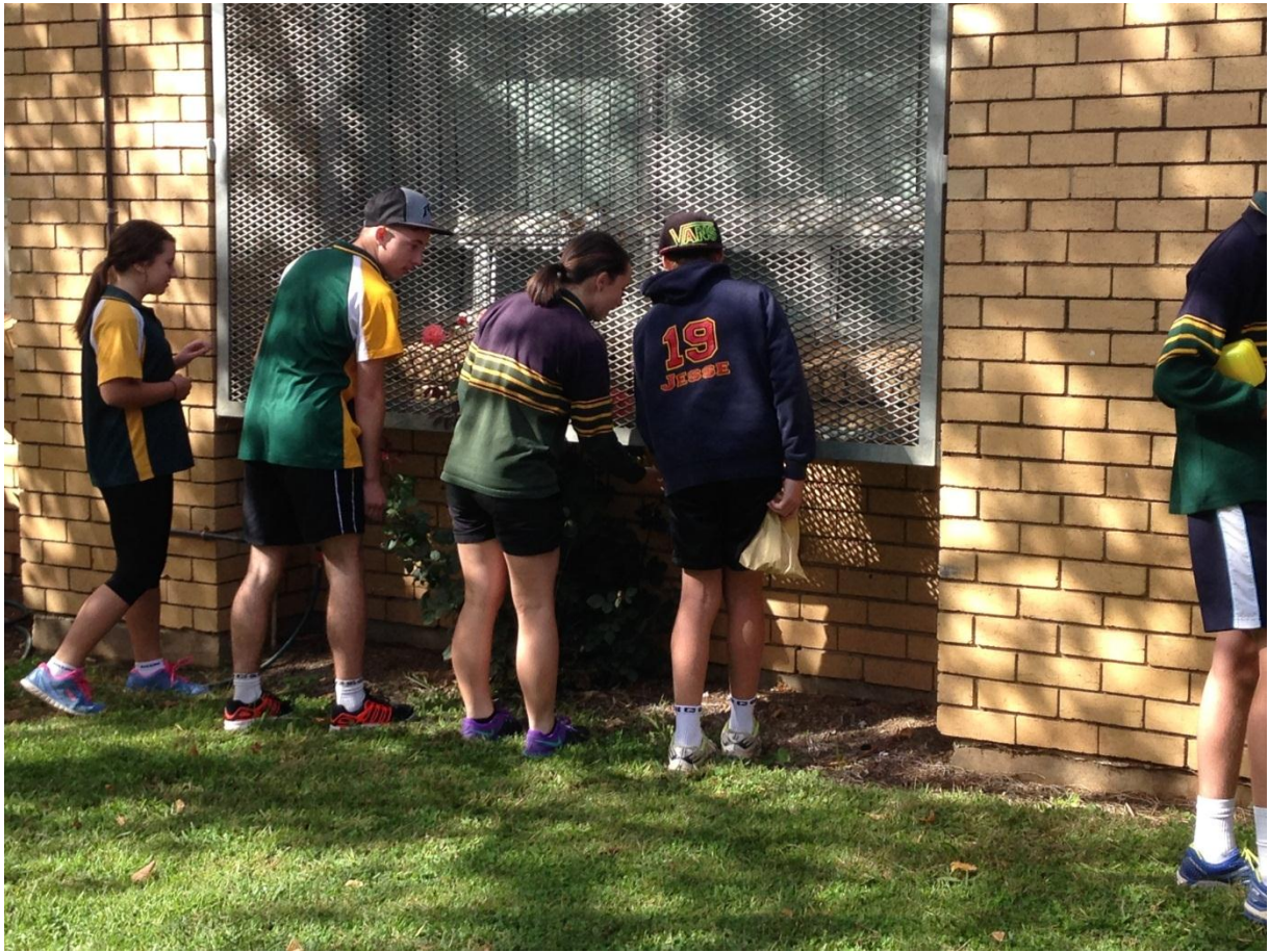
Looking for eggs in some very tricky places