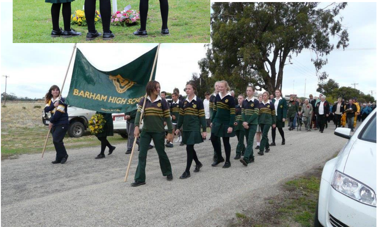
Students marching at Wakool