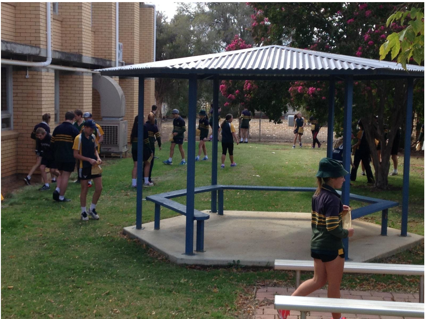
The egg race is on!

Many thanks must go to the SRC representatives for donating the eggs and apologies to Year 12 for the noise we made and to the cleaners for having to deal with the amount of foil wrappers everywhere. The students involved had an eggs-ellent time!!