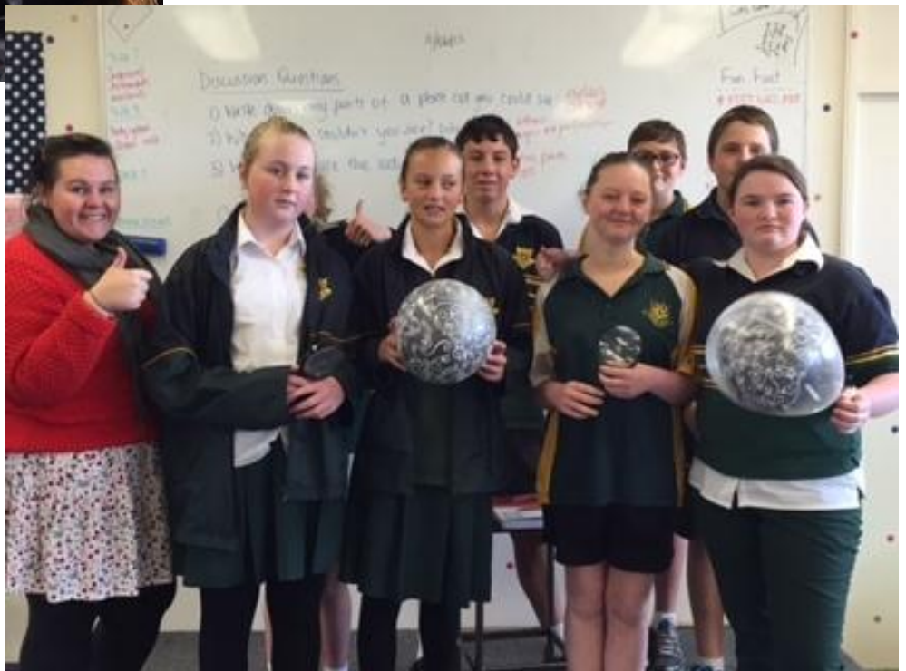
Ready to go