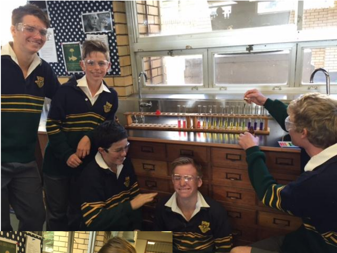
Stage 5 working hard