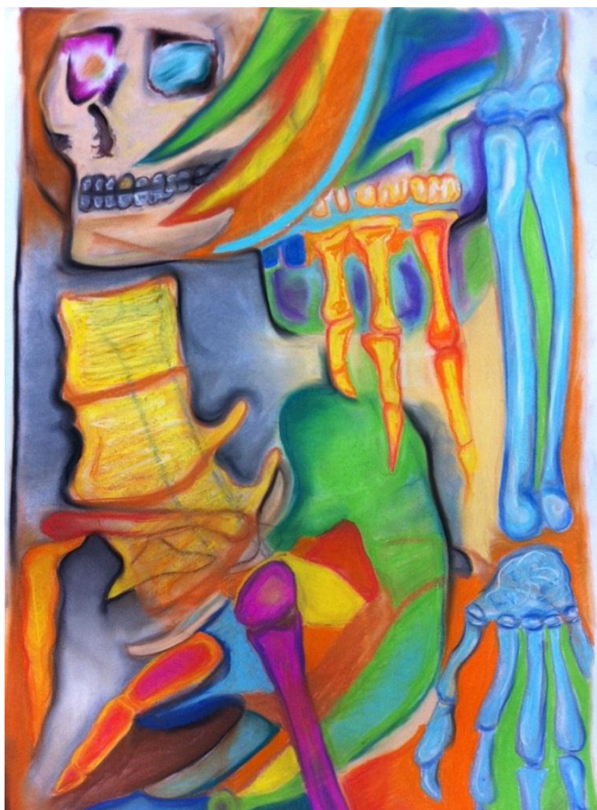
Miss Sullivan's pastel drawing from last year's VA camp