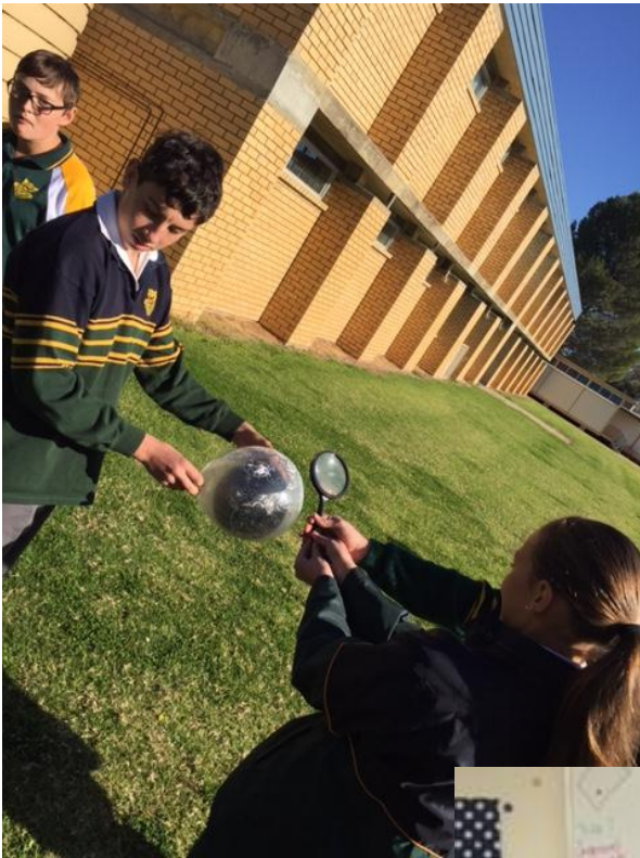
Popping a balloon inside a balloon