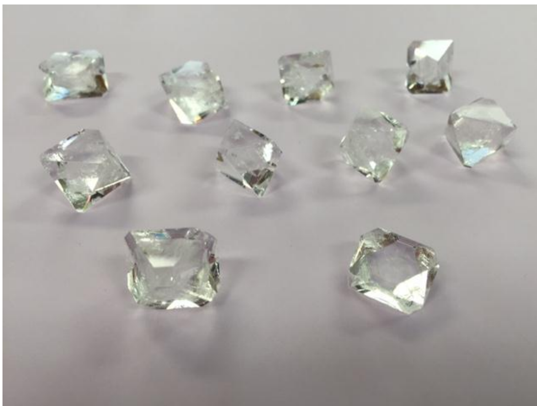
Crystals looking their shiny best