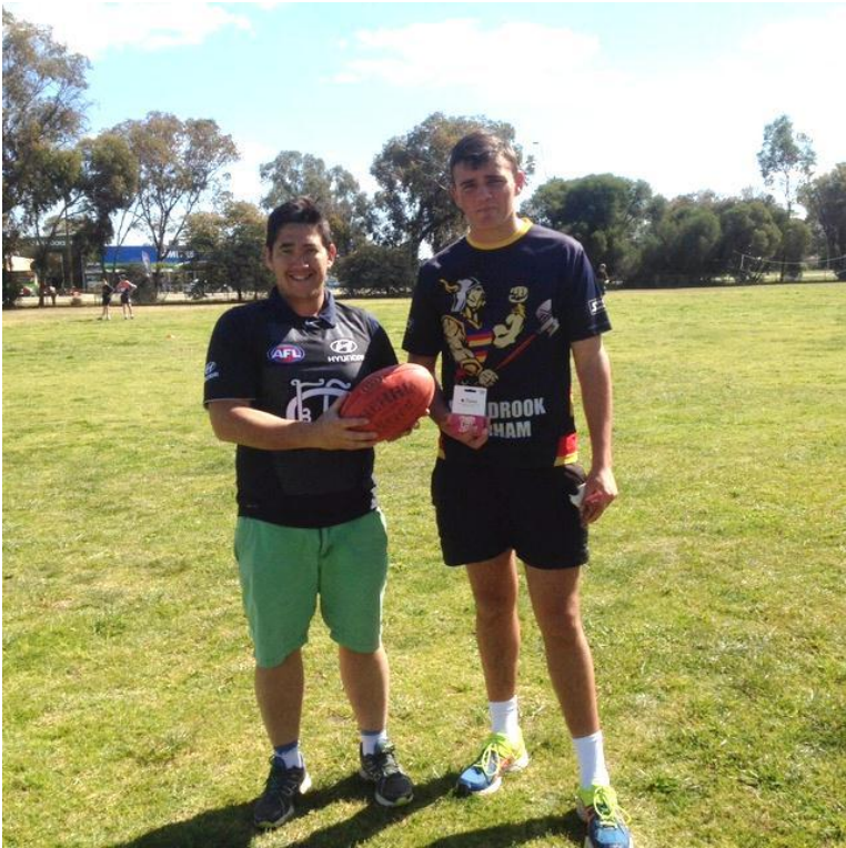
Mr Yu congratulating the winner of the longest kick