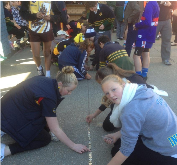
Yr 7 participating in the coin line