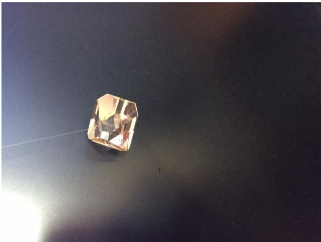
One of our award winning crystals