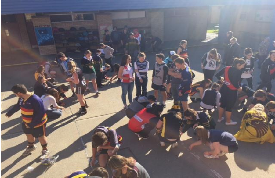
Students organising their coin lines