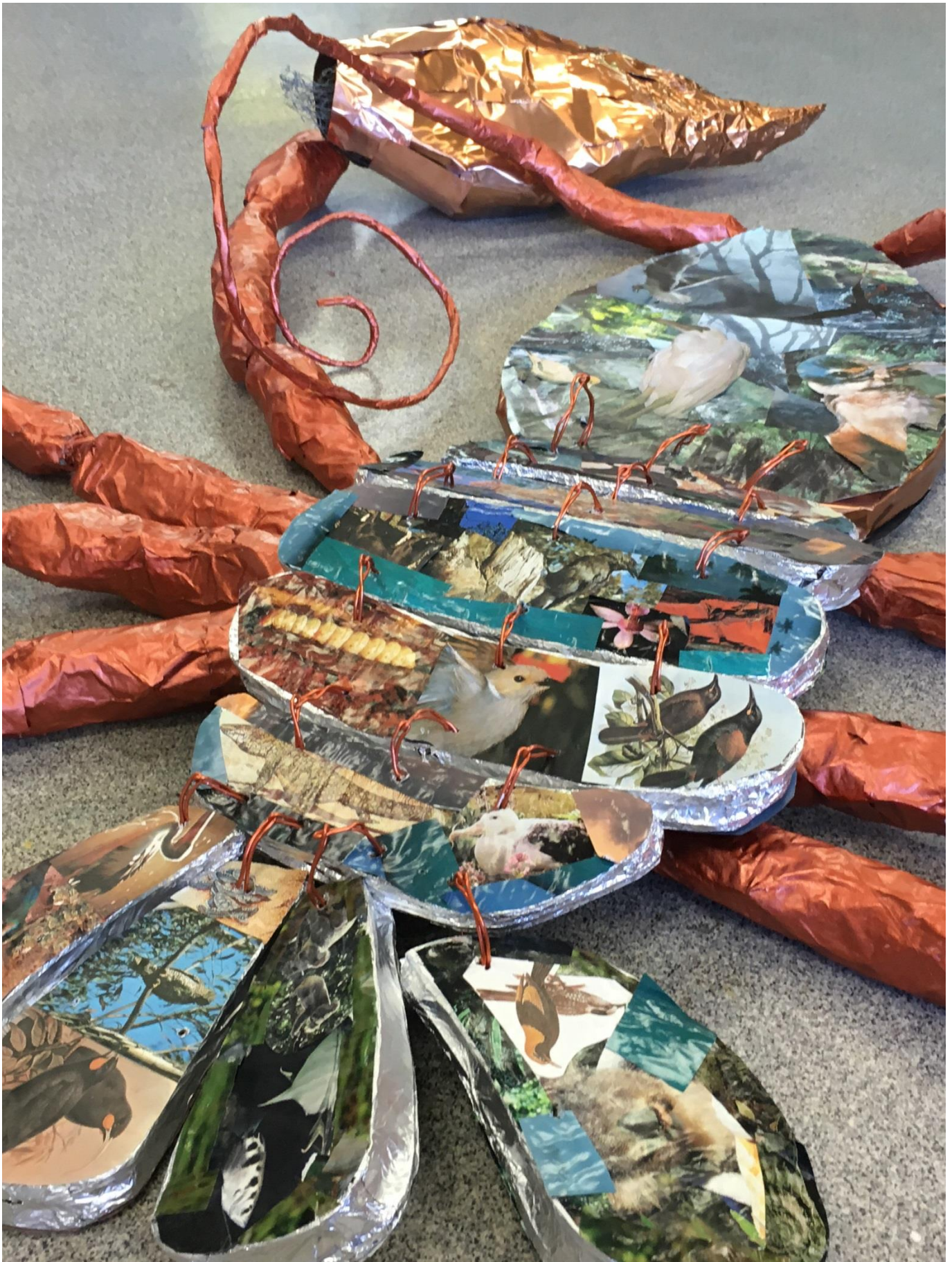
The Yabbie – Year 11 installation