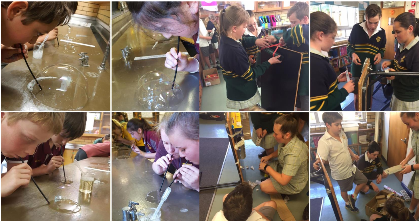
Year 6 being bubbleologists