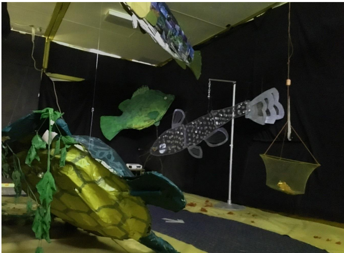
Year 11 installation

The evening was enriched by some noteworthy performances by Stage 5 Music students who entertained audiences throughout the evening. The event included delicious nibbles prepared by the hospitality students. The exhibition was held to provide a platform for students to display their talents and boost confidence of their creative talent and was well supported by family and the community.