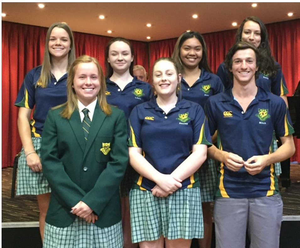
Our 2016 House Captains