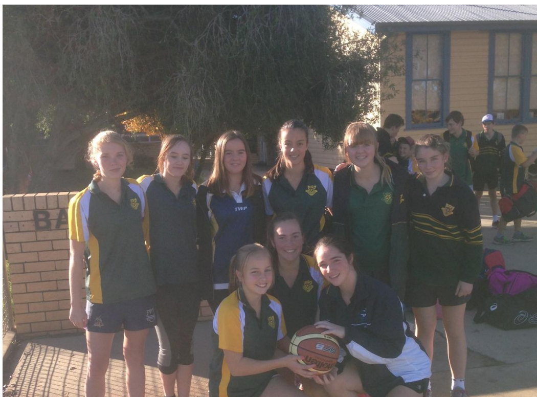
The girls team