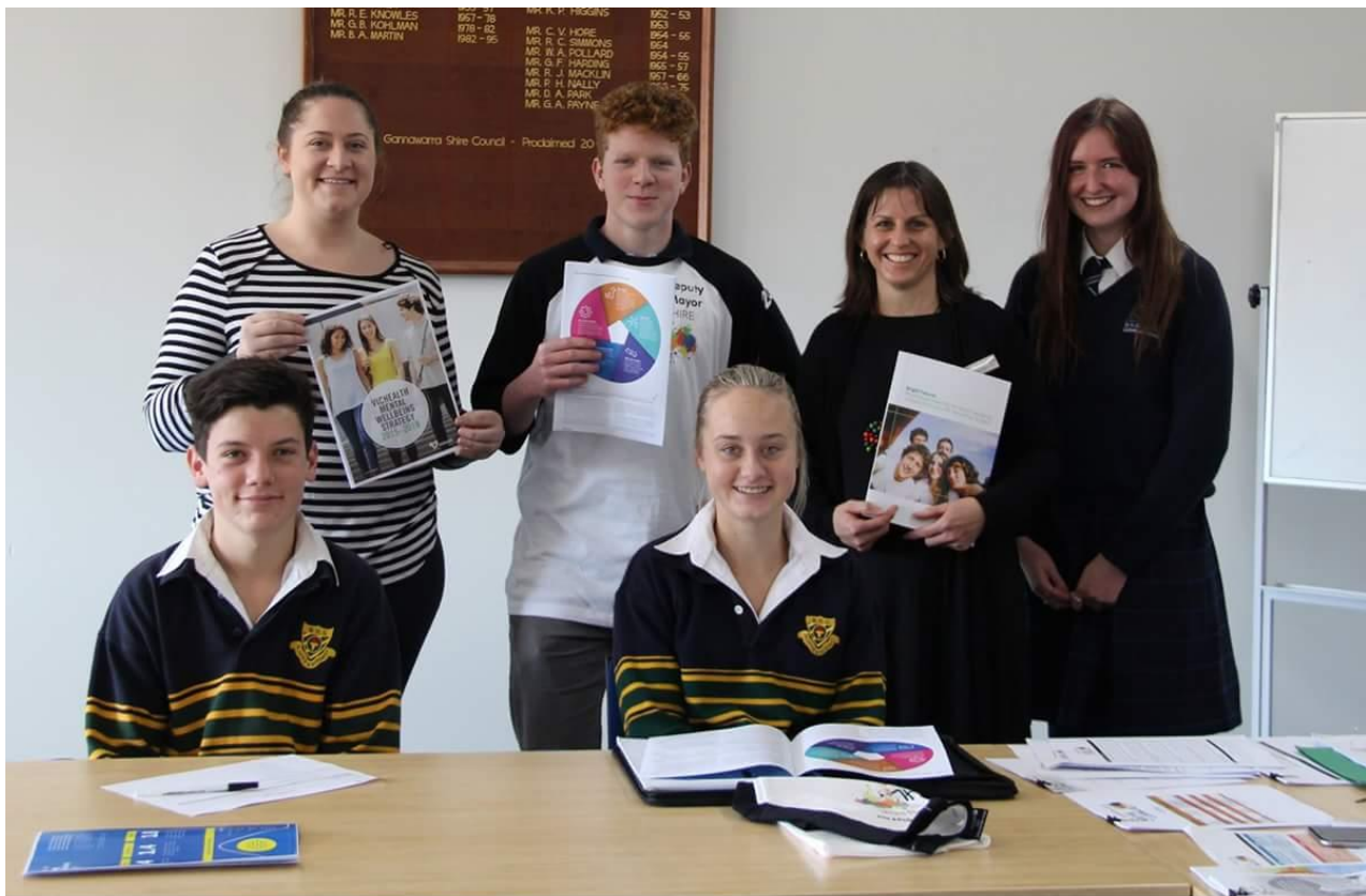
Youth Strategy mental health meeting