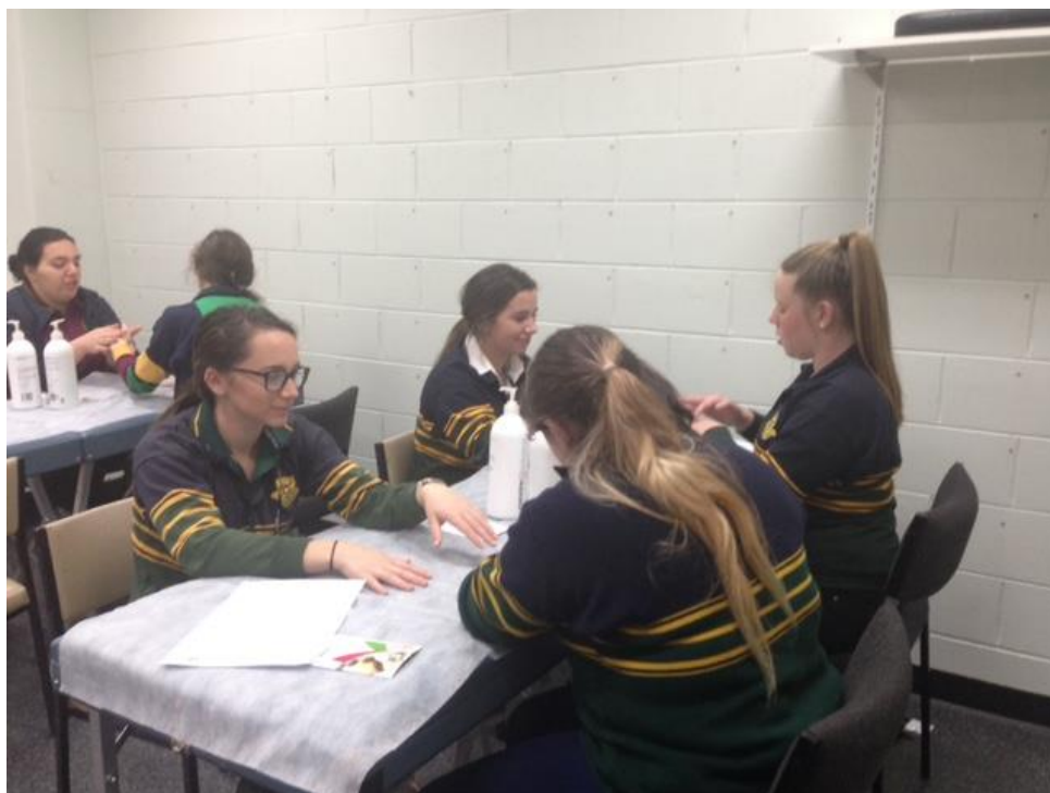
Our students participating in a beauty therapy workshop