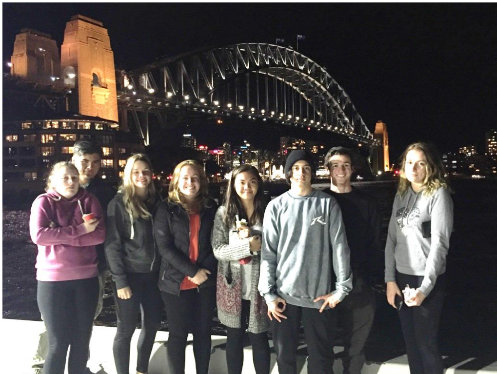
Year 12 Advanced English class