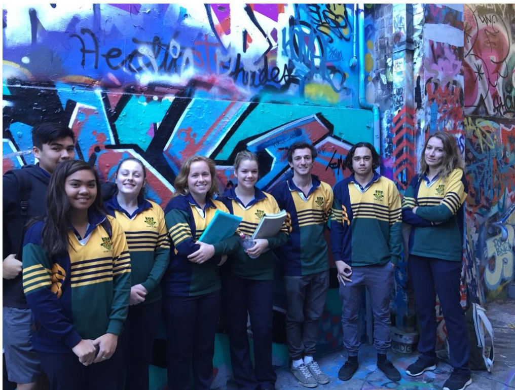
BHS students in the University of Sydney graffiti tunnel