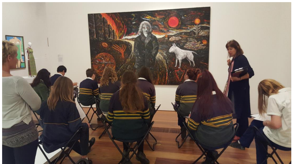
Writing About Art workshop NGV Australia