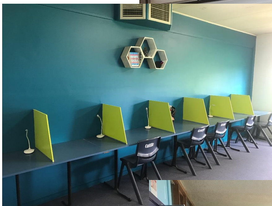
Year 12 study centre - 'The Hub'